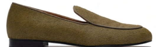
OLIVE GREEN CARRYOVER