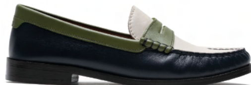
MIDNIGHT BLUE CARRYOVER