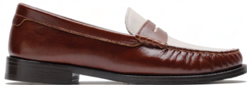
BROWN & OFF-WHITE CARRYOVER