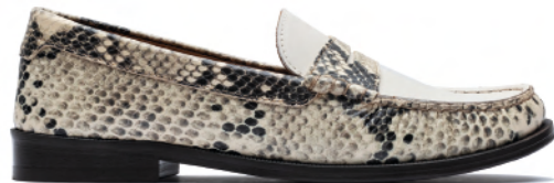
PYTHON & OFF-WHITE